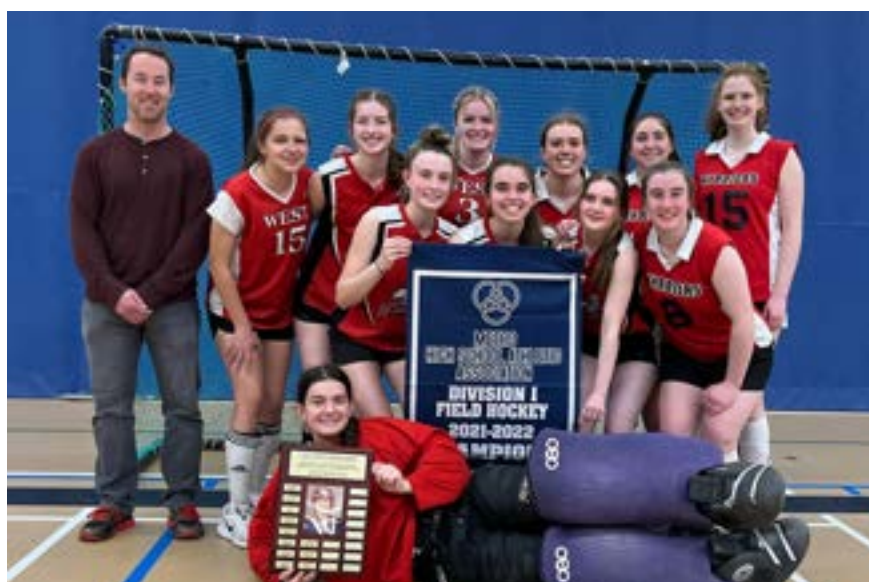
Metro High Tournament Winners, Halifax West