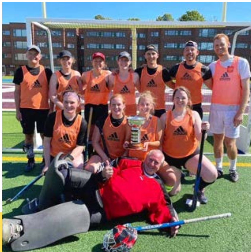
Pictured above: 2021 Atlantic Cup Winners Mashed Potatoes